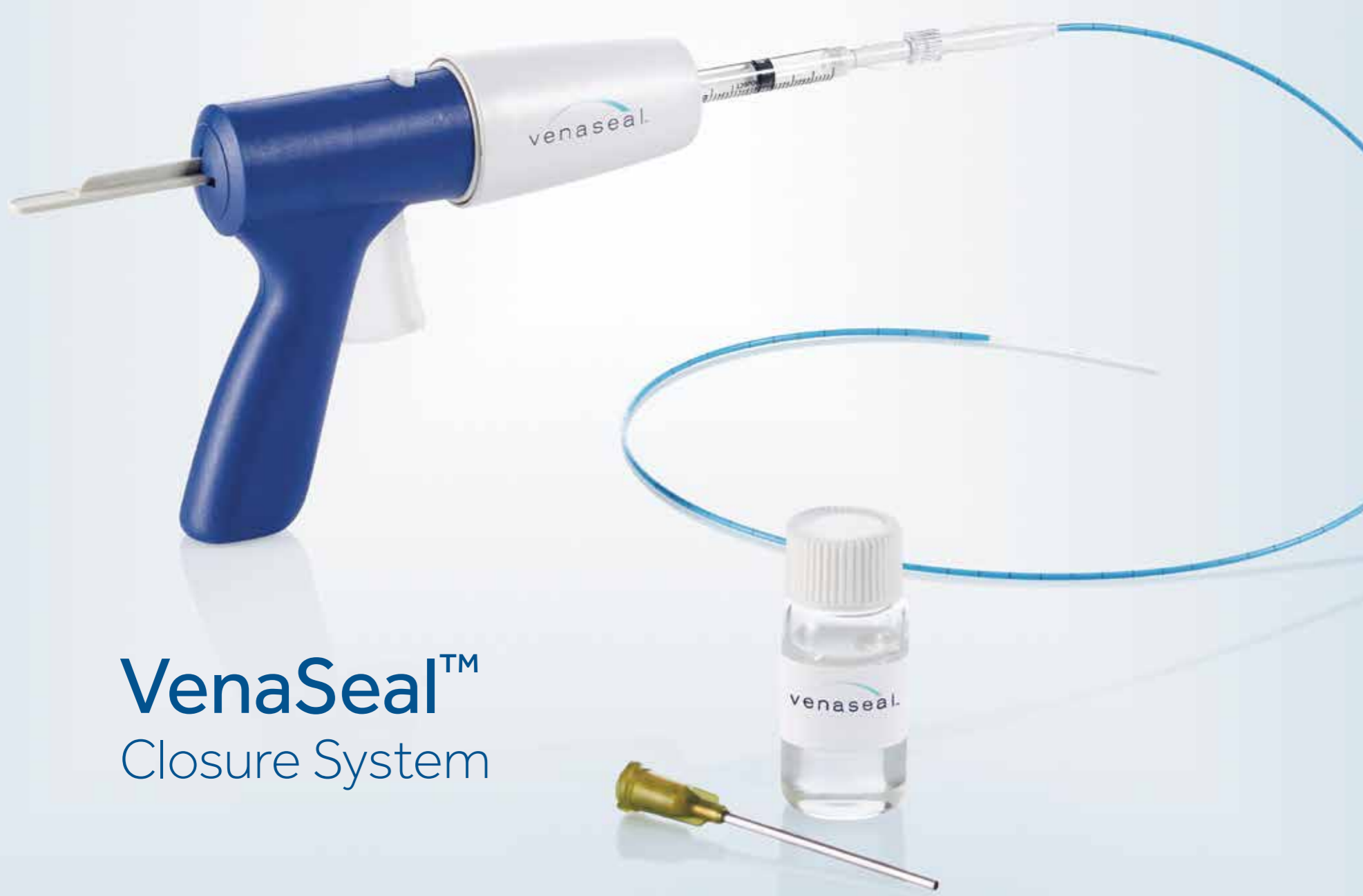
VenaSeal™ Closure System

The VenaSeal™ system delivers a small amount of a specially formulated medical adhesive to the diseased vein. The adhesive seals the vein and blood is rerouted through nearby healthy veins.